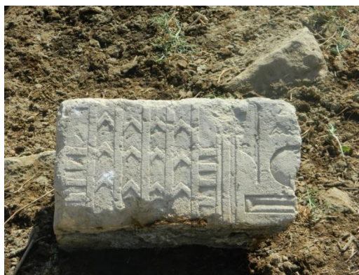
Figure 1: talatat block with the name of the Aten at El-Ashmuneim. In a simple walk through the place, one can see various examples of these blocks scattered through the ground (RSL). Photo taken in November 1st 2012 by Rennan de Souza Lemos.

A small portion of it was excavated firstly by Borchardt and then by the second season of the Egypt Exploration Society expedition under Leonard Woolley. He called the site the River Temple, but that is a misleading name. It was the part of the city that continued to be occupied at least until the late 20th dynasty, because one of the houses had a reused block from the time of Ramses III, which raises the interesting question: where did that come from? Was there a building of Ramses III of a fairly formal kind? That is a quite exceptional part of the site. Over the rest of the site, demolition is apparent from the loss of the stones and the way they were removed. Those who did the work had difficulty removing the lowest layer, and so they chipped holes down the sides of the blocks into the gypsum foundations to help lever the last blocks up. It shows they were determined to remove as far as possible every block, leaving very few behind. Across the river, at El-Ashmuneim, a few thousand blocks have been found, and it is assumed that they came from Amarna (figure 1). But unlike at Karnak, they have been transported across the river and used in several constructions. It is not possible to reconstruct whole areas of scenes from the blocks and to determine from which building they came. There are some who think that a portion came from the Great Aten Temple, but the evidence is not really very secure.