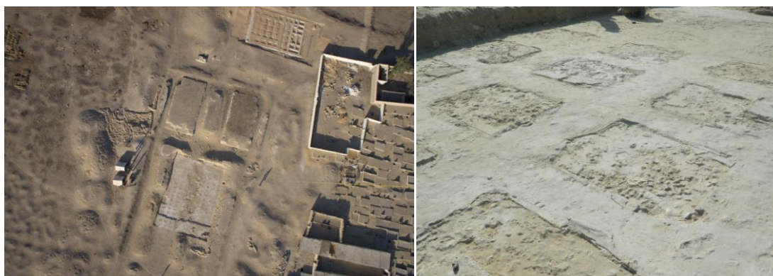
Figure 2: aerial photography showing the frontal part of the Great Aten Temple and the nearest tombs of the modern cemetery (north to the right). Figure 3: foundations of the offering tables at the Great Aten Temple (Oct. and Nov. 2012 fieldwork).

It is a large and expensive project which is pushing our resources to the very limits. It will take several years to make significant progress. But at the end I hope we will have a more detailed record of the building that will be better protected from further loss of its land. The temple will also be available for visitors to inspect and see the unusual design it had, filled with offering tables (figures 3), which tell a lot about how Akhenaten saw the needs of the Aten and its cult. And, of course, visitors will be able to make a comparison for themselves between what they see on the ground and the pictures they can see in the tombs.